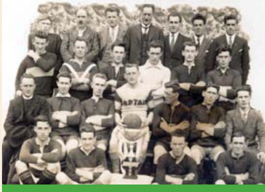
First Ballyshannon Team to win the Donegal Senior Championship, 1929

Garda Síochána brought young men from around the country to Donegal, many of them Gaelic games players or supporters, bringing with them this tradition. New Clubs were formed in the county during this decade including Ardara (1921), Glenties (1921), Maghery (1923), Kilcar (1924) and Donegal Young Tír Conaills (1924). Aodh Ruadh's of Ballyshannon was also re-launched in 1924 (originally established in 1909), having been one of the more prolific clubs during the