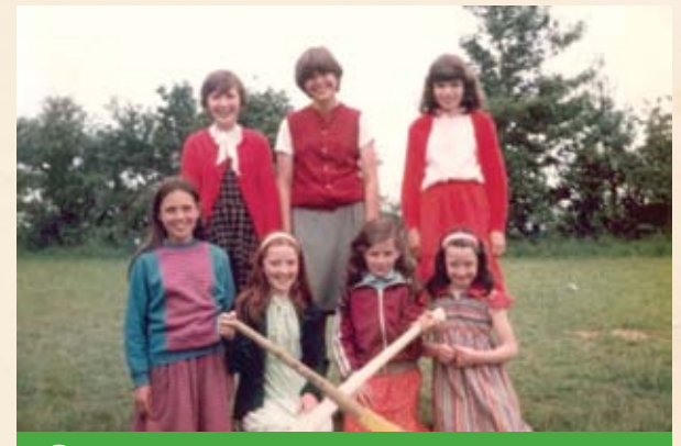
Young Camogie Players

As Irish is the official language of the organisation, a significant amount of the collection is in Irish. Published material is generally in both English and Irish although some material is in Irish only. There is a variation in the spelling of certain placenames or clubs in the Irish language material. Where this is the case the material has been listed with the name as it appears on the document. Material has